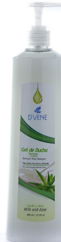
Leche y Aloe