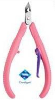
159- Alicate cutícula Flex