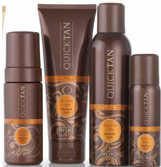
Instant Self Tanning

Rapid absorption instant tanners, leaving a natural tanned natural color to the skin.