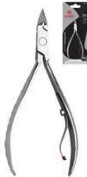
722- Alicate cutícula Profesional Acero inoxidable