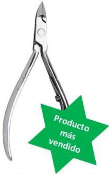
522- Alicate para cutícula Acero carbono niquelado