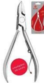
520- Alicate uña Acero carbono niquelado