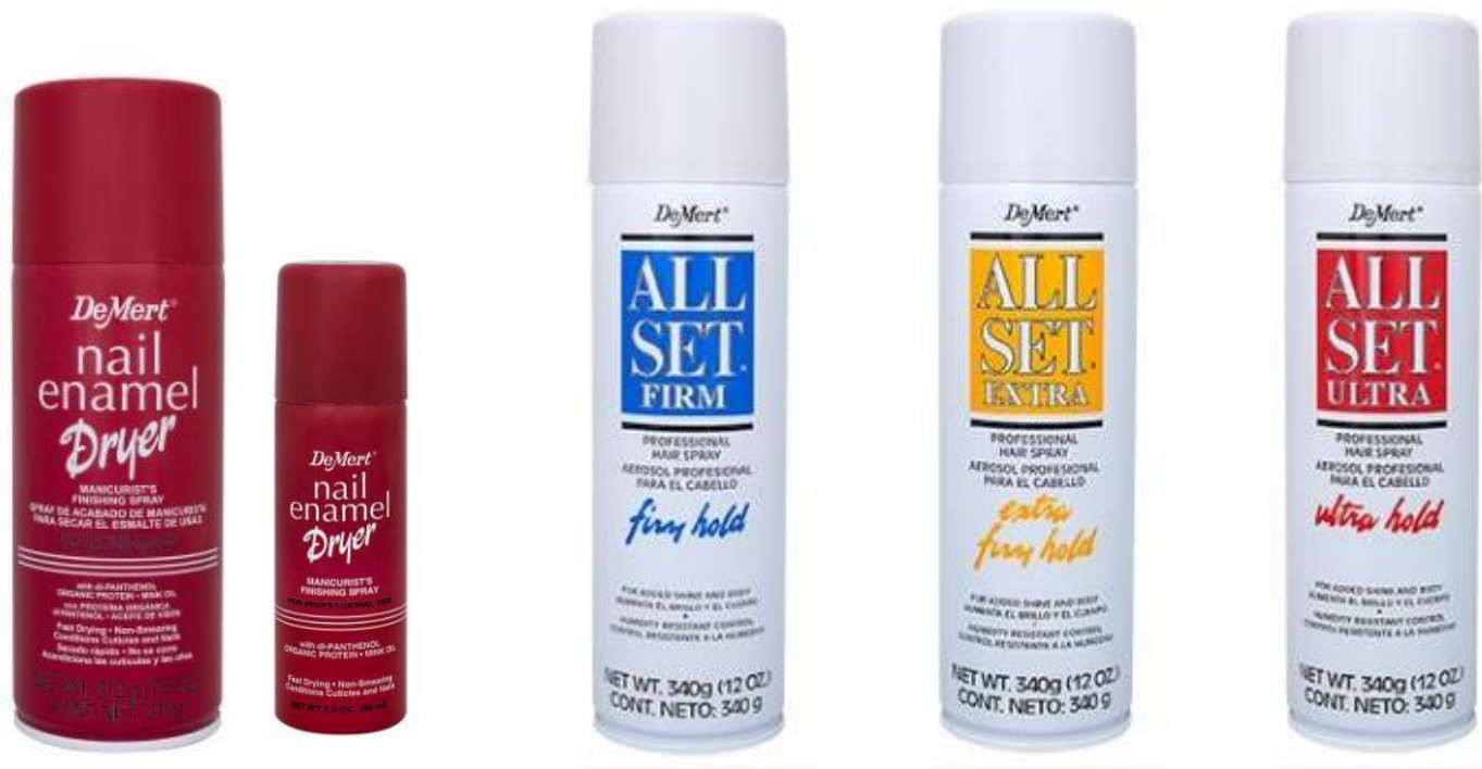
Nail Enamel Dryer