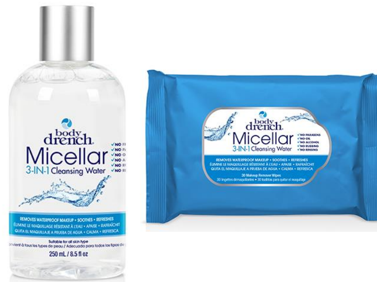
MICELLAR 3-IN-1 CLEANSING WATER

Removes makeup, soothes and refreshes the skin. Perfect for face, eyes and lips.