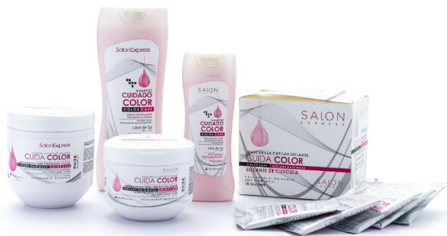
Line Care Color